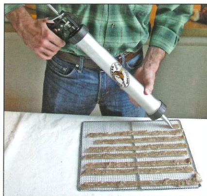
Squeeze strips or sticks on to your Jerky Screen.